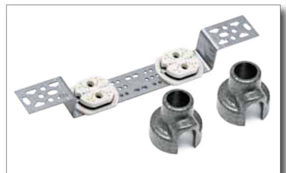
Flush mounting installation utilising the LEIFELD Sound-Shield and Sound-Cap