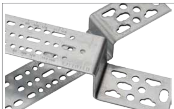
Standard sanitary centres pre-stamped on both sides