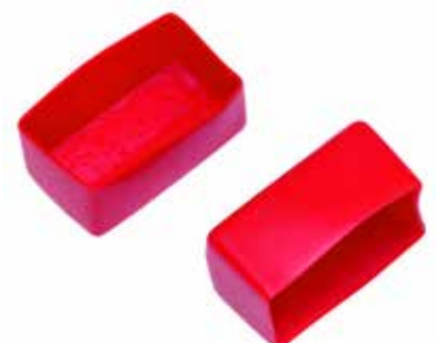
Part.#: 1320 C-Profile End Caps