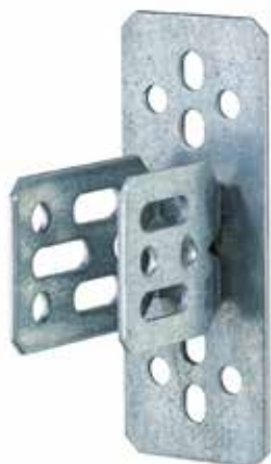
Part.#: 1310 C-Profile Bracket H, horizontal