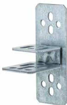
Part.#: 1311 C-Profile Bracket V, vertical